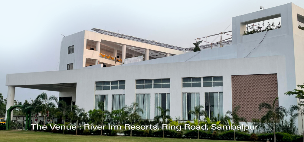
The Venue : River Inn Resorts, Ring Road, Sambalpur