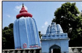
Huma Leaning Temple